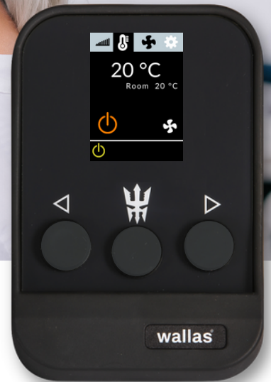
The Advanced Control Panel enables intelligent temperature control and system diagnostics.

Wallas-Marin is known for durability, sustainability, and performance, which rise from strong Finnish values of pursuing quality in every aspect.