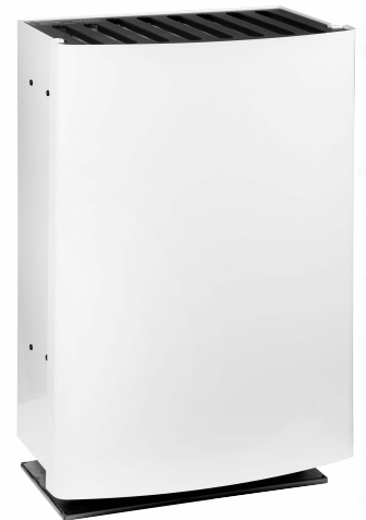
Wallas 40CC w/white front cover

When the house is warm even before your arrival, you will begin to enjoy your valuable free time at the cabin even sooner. The cabin heater will remove moist air, mildew and replace stale air with oxygen-rich air. You can use diesel #2, or #1, kerosene or Klean heat fuels without any adjustment.