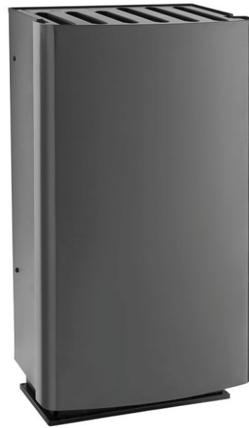
26CC Heater with grey front 26GF