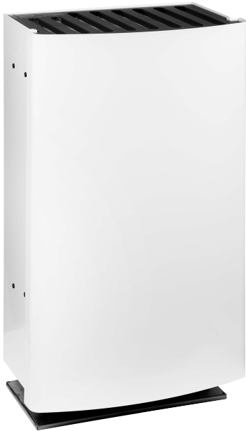
26CC Heater with white front 26WF