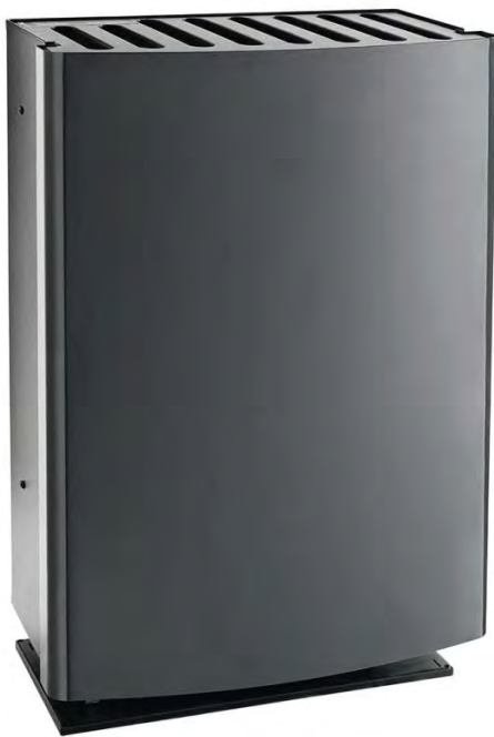
40CC Heater with grey front 40GF