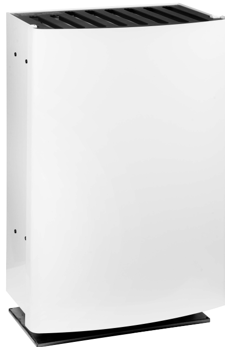
40CC Heater with white front 40WF